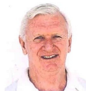
Les Capes (C)