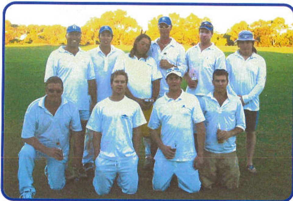
6A's after a good win