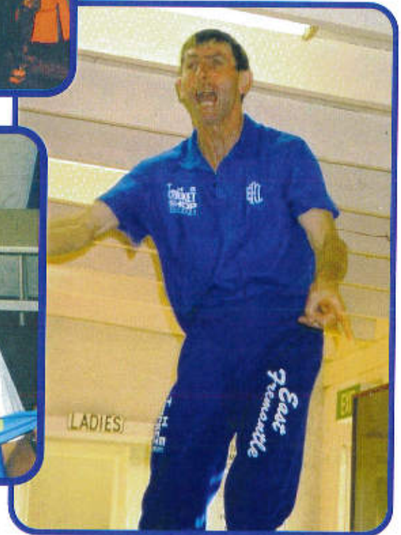
The Cat in full voice