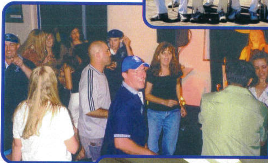
Bourbon, Beef & Band Night