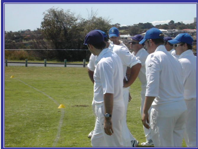
An EFCC 1st grade team takes the field for first time in 3 years(Oct)