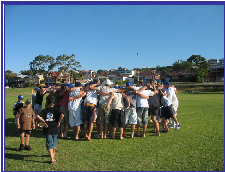
Roll em Bowl em!!!...after the One Day Final at Preston (Feb)