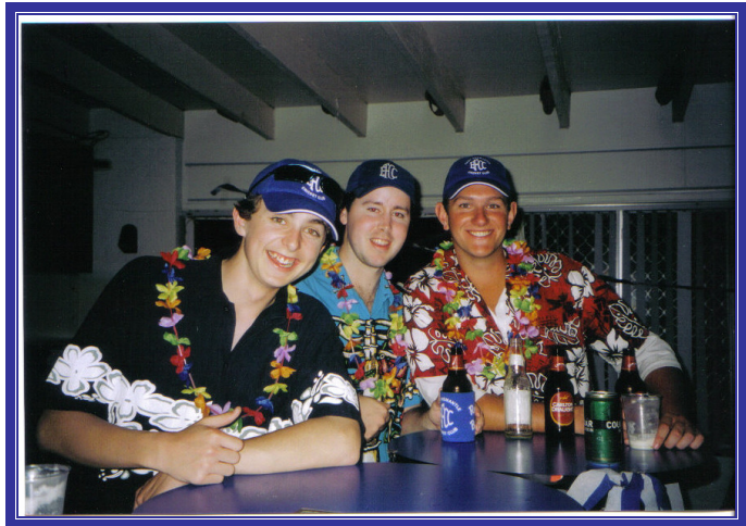
Spriggy, Brownny and Knighta enjoy Hawaiian night.