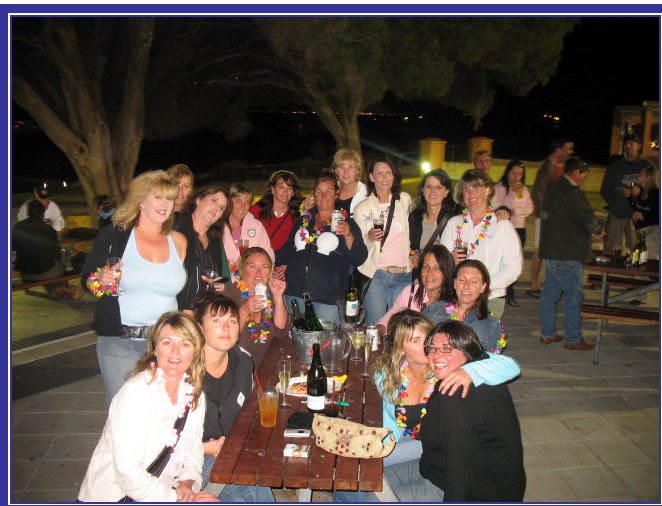
The Ladies' Rottnest trip