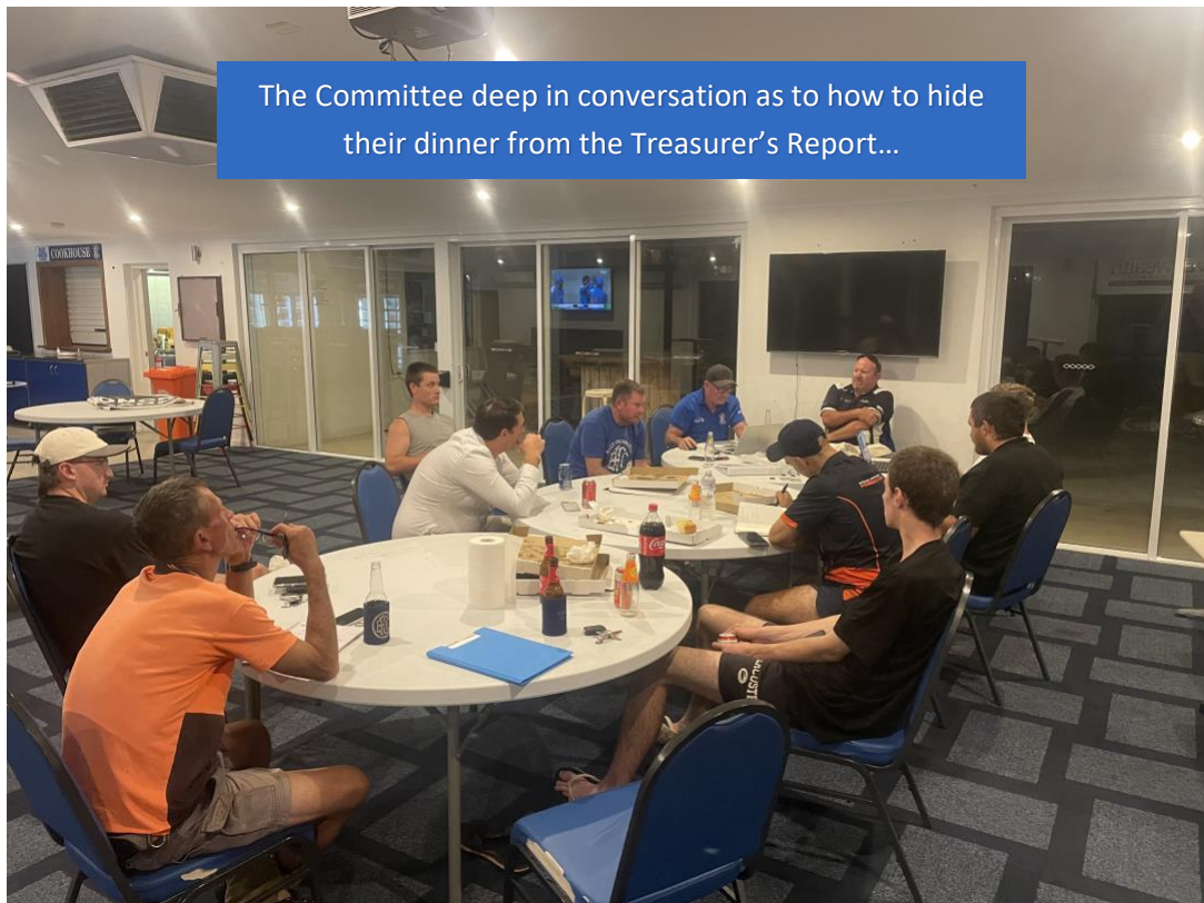
The Committee deep in conversation as to how to hide their dinner from the Treasurer's Report...