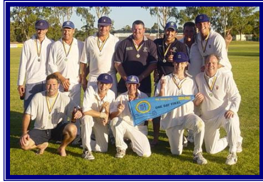
One Day Flag