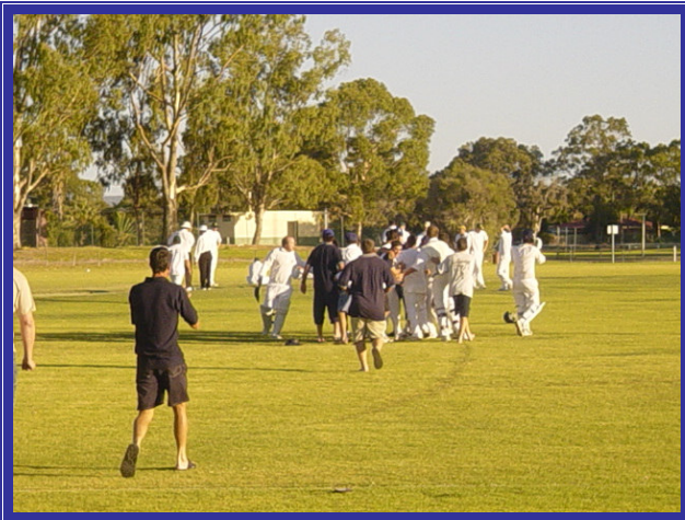
Pitch invasion after the last ball at the One Day final