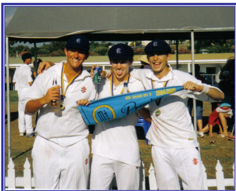
Knightsy, Stevo and Spriggy after the Grand Final