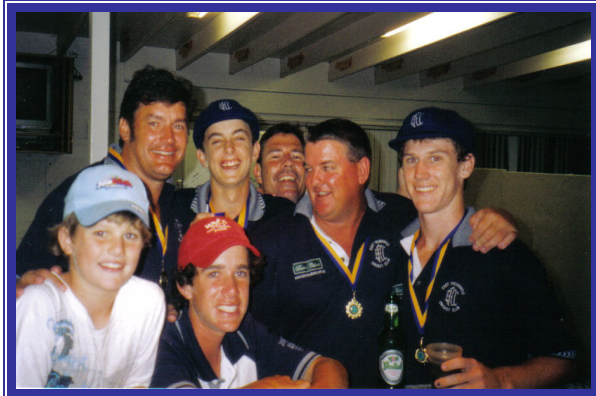
Celebration at the club