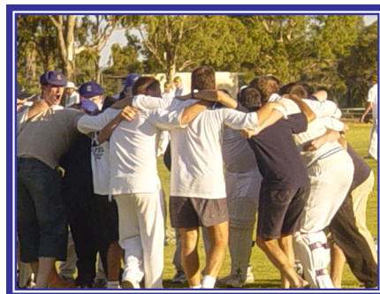
Roll em Bowl em!! After the One day final