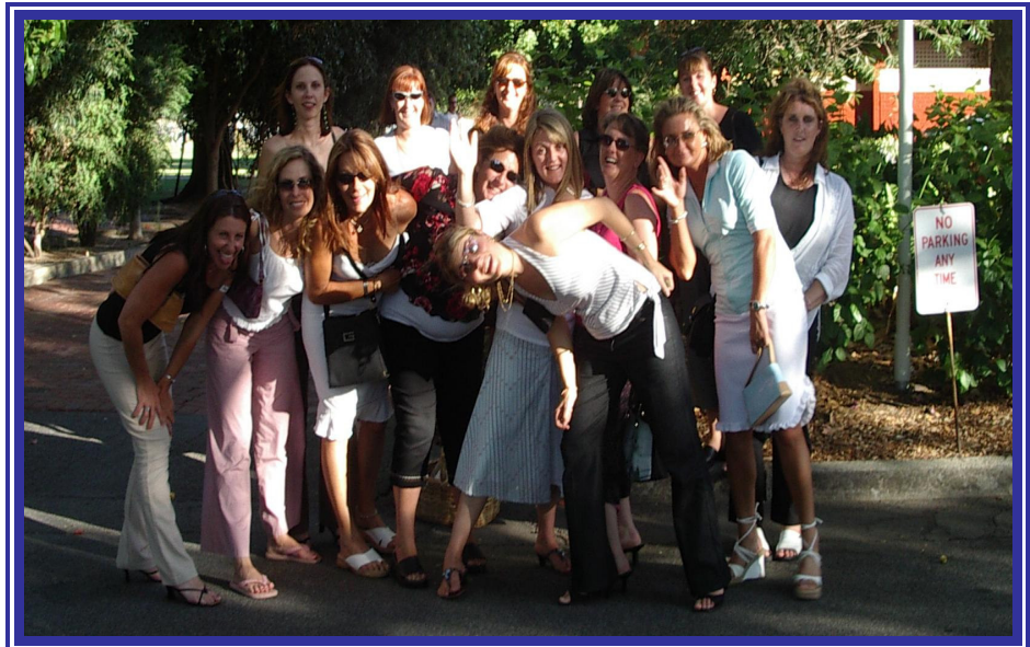
The Ladies' Race Day