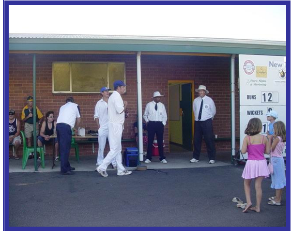
The presentation at Thornlie