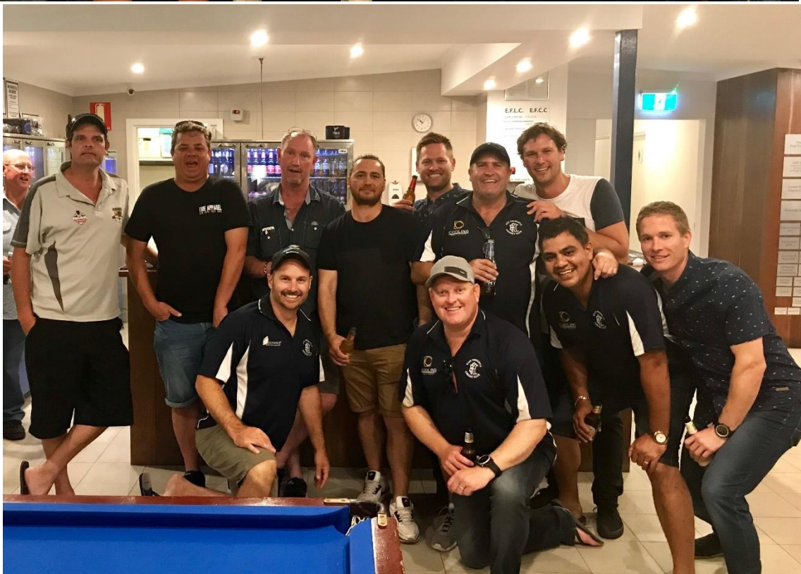
2007/08 Premiershhip Team celebrating their 10 years Reunion