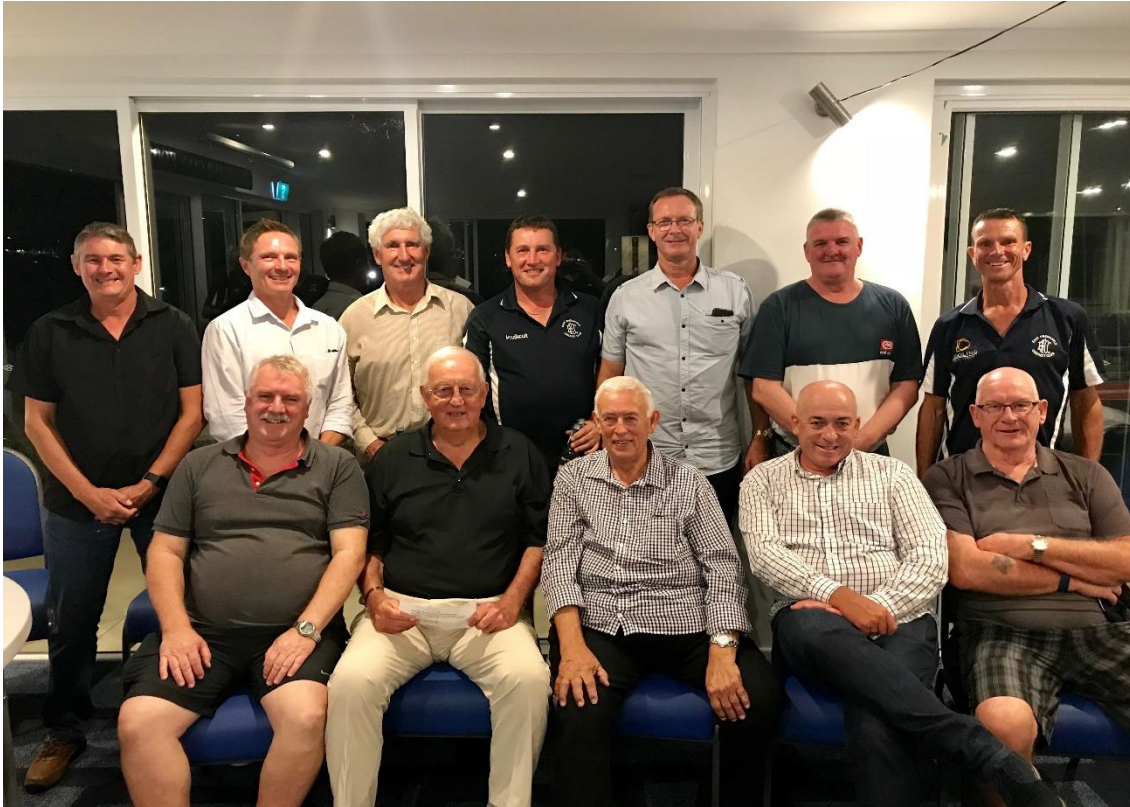
1987/88 Premiershhip Team celebrating their 30 years Reunion